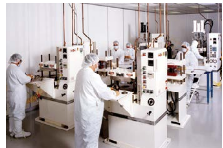
Clean room application